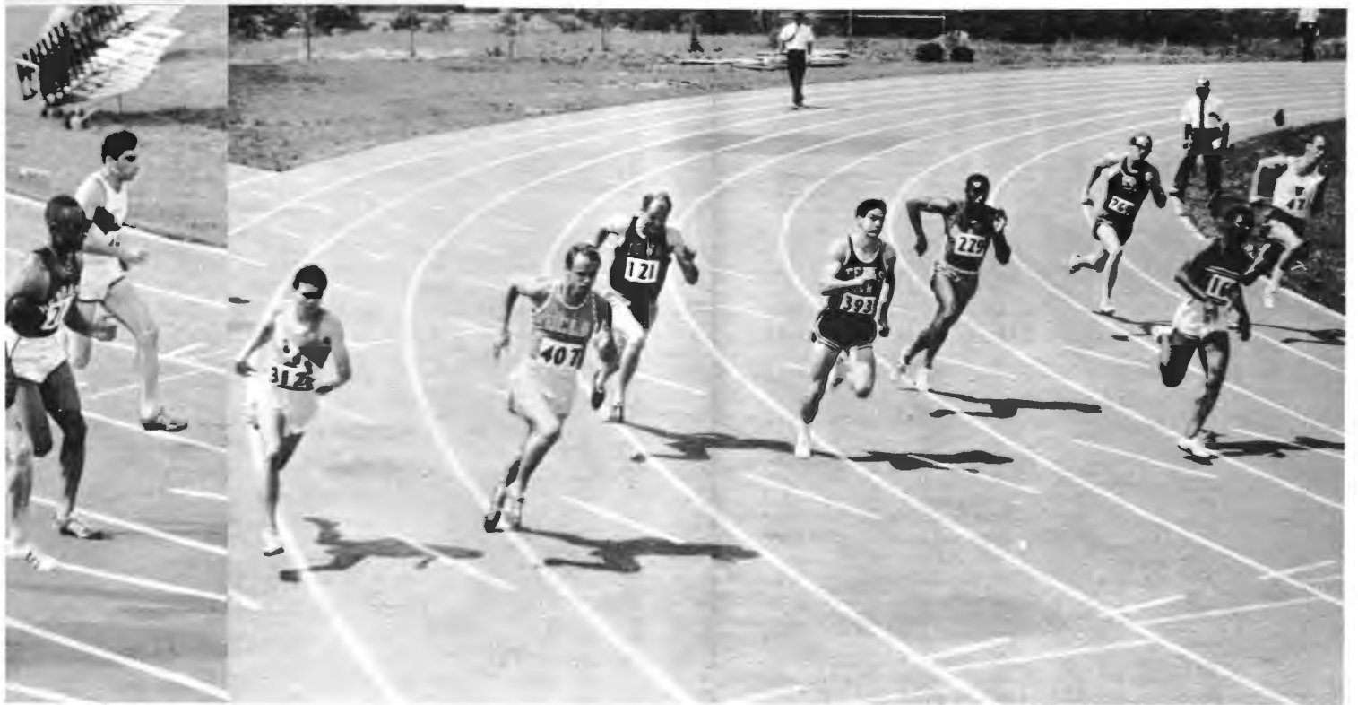
E CAMINTI (New IE (Nebraska), messee State).