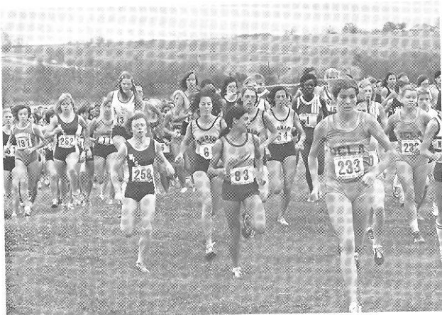
... and they're off!

The overriding theme of the AIAW in its work and relationship with other organizations is one of cooperation and understanding complementary to its own purposes and recognizing a commitment to equality for women in sports programs and leadership roles.