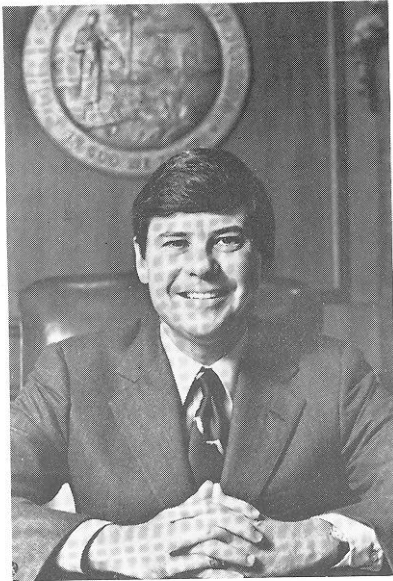
Governor Bob Graham