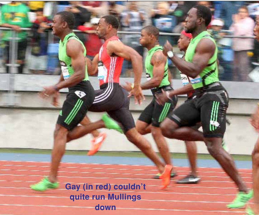
Gay (in red) couldn’t quite run Mullings down

Big kicks were needed to decide tight battles in the multi-lap races. Kenia Sinclair, taking a rare step up from her beloved 800, timed her move off the final curve perfectly to win the women’s 1500 in 4:08.06, just ahead of Morgan Uceny (4:08.42).