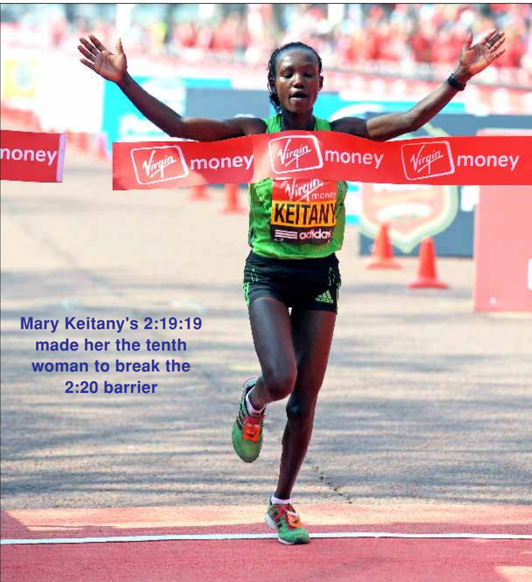
Mary Keitany's 2:19:19 made her the tenth woman to break the 2:20 barrier